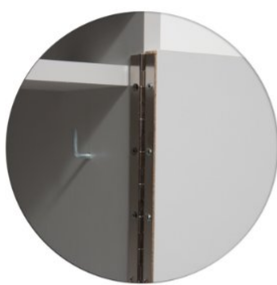
180 Degree Solid Steel Hinge