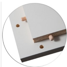
Full Glue and Dowel Assembly

All the great features now in a compact size!